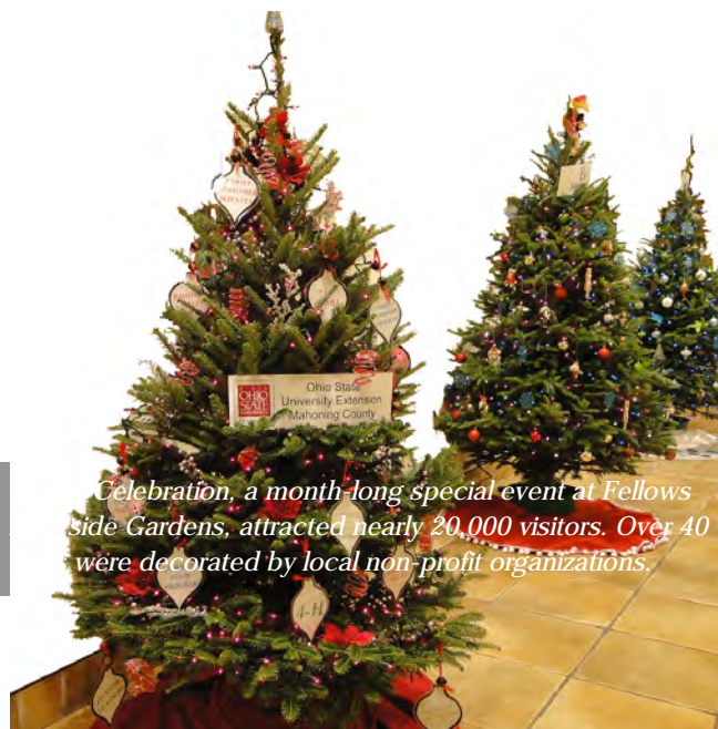
Celebration, a month-long special event at Fellows Side Gardens, attracted nearly 20,000 visitors. Over 40 were decorated by local non-profit organizations.