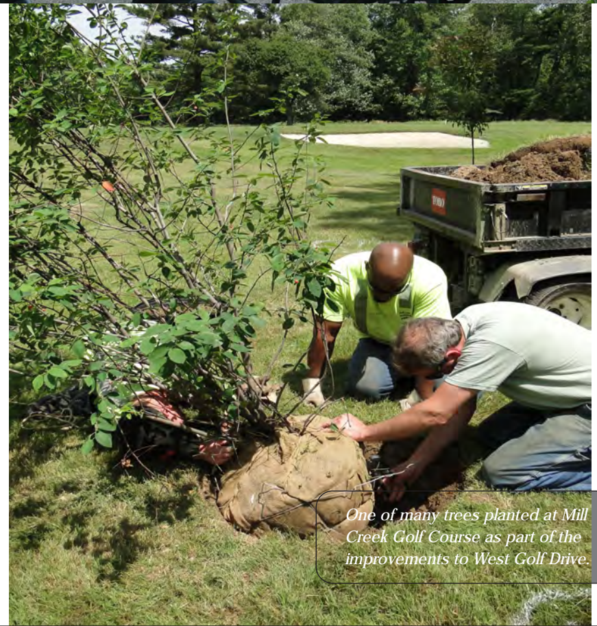
One of many trees planted at Mill Creek Golf Course as part of the improvements to West Golf Drive.