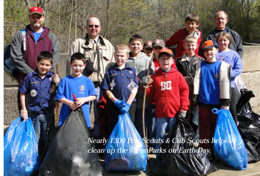
Nearly 1300 Boy Scouts & Cub Scouts helped clean up the MetroParks on Earth Day.

Twelve hundred children attended Children’s Book Festival: Plant the Seed to Read at Fellows Riverside Gardens. The MetroParks partners with The Public Library of Youngstown and Mahoning County, Altrusa International of Youngstown and Western Reserve PBS to promote literacy.