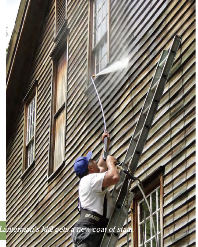
Lanterman's Mill gets a new coat of stain.