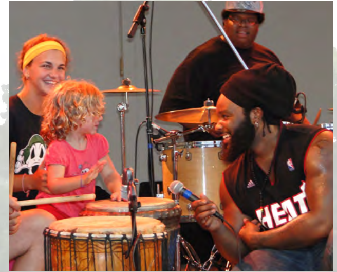
7UP Summerfest Spectacular attracted nearly 14,000 people in 2011.