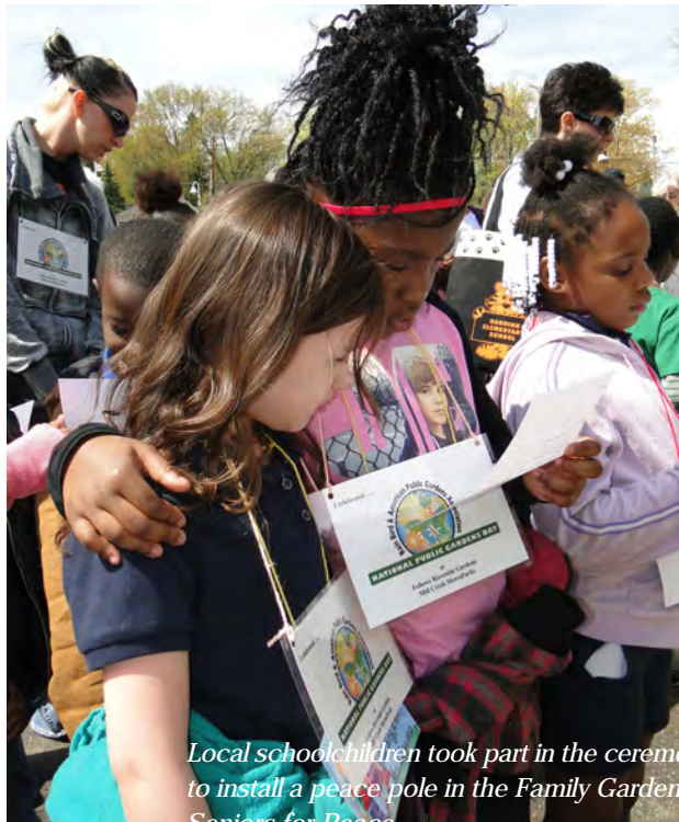
Local schoolchildren took part in the ceremony to install a peace pole in the Family Garden by Seniors for Peace.

A Shakespeare festival was held at the Judge Morley Pavilion in cooperation with the Mahoning Valley Players. Nearly 500 people attended the two performances.