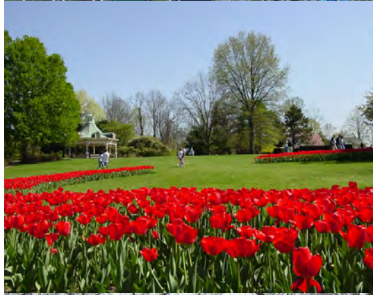
Fellows Riverside Gardens