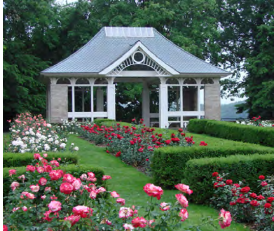
Kidston Pavilion in Fellows Riverside Gardens