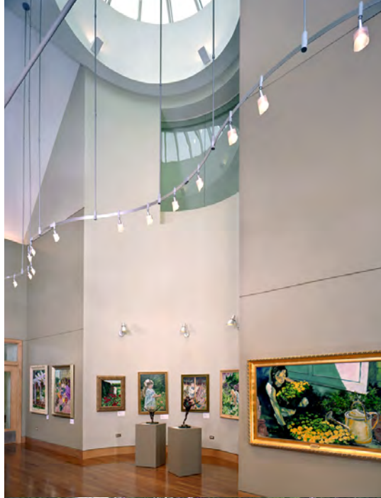
Weller Gallery in the Davis Education & Visitor Center