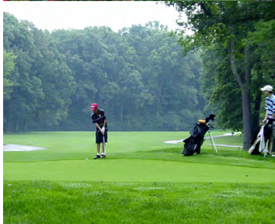
Mill Creek Golf Course