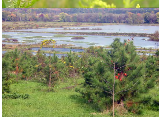
Mill Creek Wildlife Sanctuary