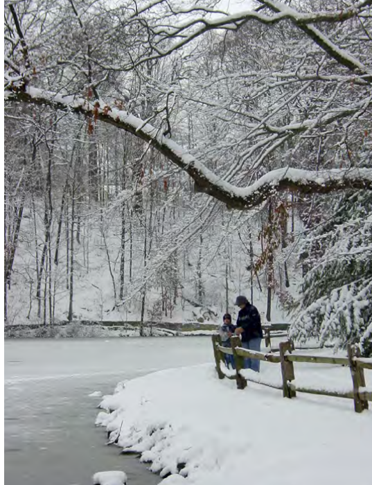
Winter at the Lily Pond