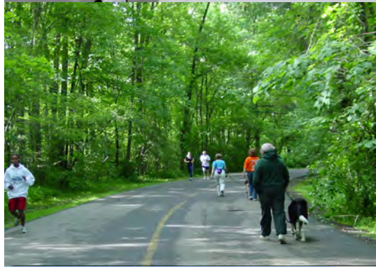
East Golf Hike/Bike Trail