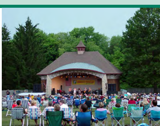
Judge Morley Performing Arts Pavilion

SUSPENSION BRIDGE • PARAPET BRIDGE WALL GARDEN • DAFFODIL MEADOW