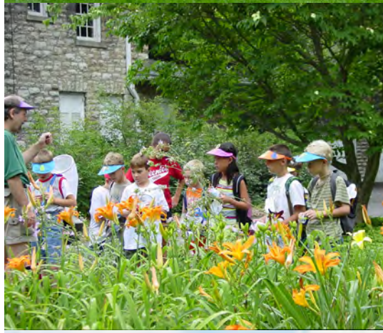
Children's Program at Ford Nature Center