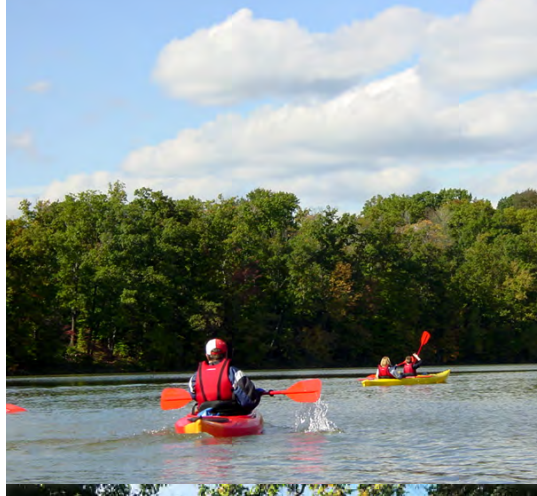
Kayaking on Lake Newport