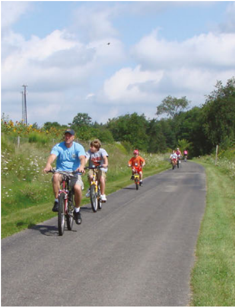
A pathway to family fun for all ages!