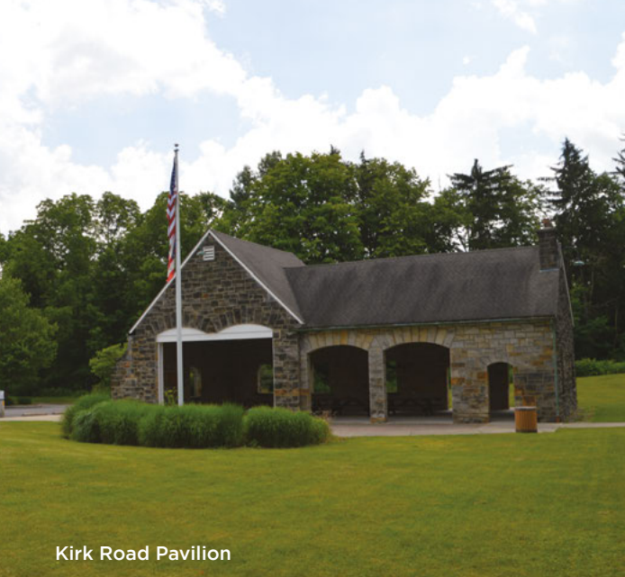
Kirk Road Pavilion