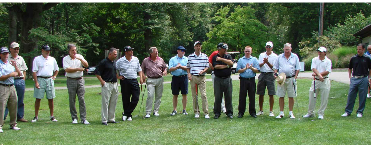
Golf professionals in the Pro-Am Tournament

Improvements in 2009 to Mill Creek Golf Course included: new tee signs on both courses to assist golfers with yardage and directions; bunker renovations on 3 North and 16 South and major repairs on 4, 11 and 16 North; shaping, contouring and edging all bunkers; and tree maintenance which included stump grinding, lifting, trimming, root pruning and removal.