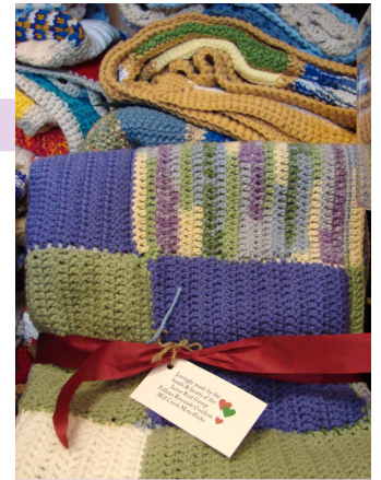
Loose Knit Group donates hand-made blankets

Alpha Psi Omega of the YSU School of Theatre furnished 28 hours of skilled labor in rigging and removing the scenery for Halloween at the Judge Morley Pavilion. The fraternity purchased the materials and performed all the construction, painting, and rigging, and removed it on event day.