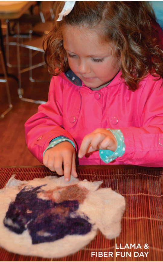
LLAMA & FIBER FUN DAY

CATTAILS AND WHEAT $ ♦ Fellows Riverside Gardens 10/22 | 6:30 – 8:30 pm Design an autumn arrangement of flowers, cattails and wheat in a basket. Register/pay by 10/20. $40; FFRG $34