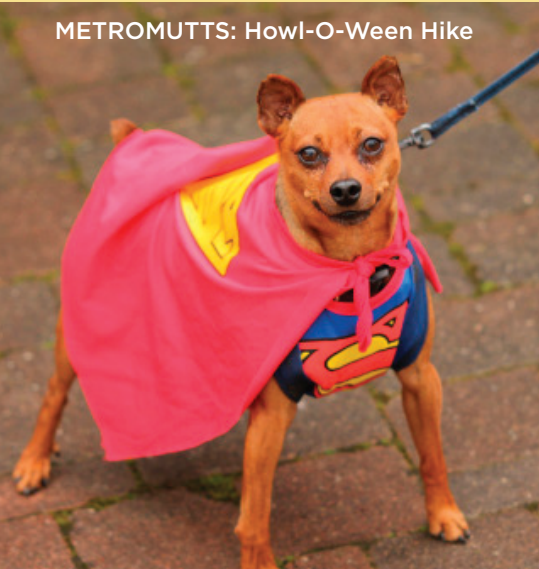
METROMUTTS: Howl-O-Ween Hike

METROMUTTS: Howl-O-Ween Hike MetroParks Bikeway - Kirk Road Trailhead 10/17 | 10 am Have a “howl” of a good time on this trek down the Bikeway. Bring your dog dressed in his/her Halloween finest – you are welcome to dress up, too! Costume contest, prizes, and refreshments in the pavilion following the hike. MetroMutts members receive a free pumpkin and photo with their dog. Easy, 2 mi. Donated items for Animal Charity Humane Society welcome. Call FNC for details.