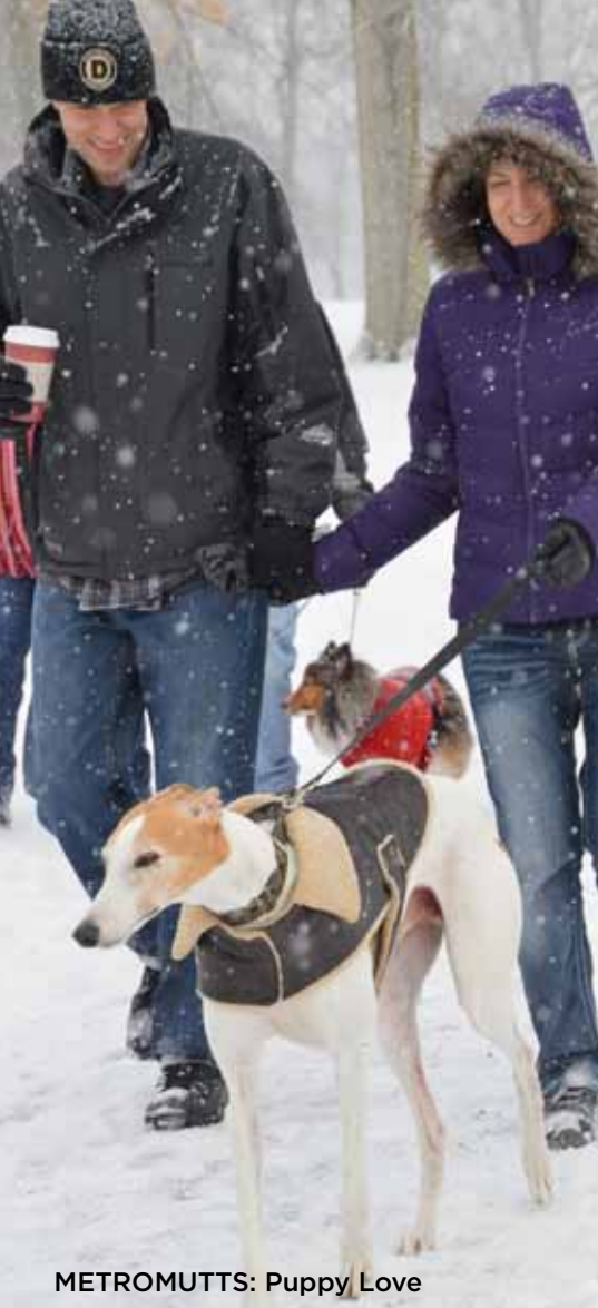
METROMUTTS: Puppy Love

2/2 | 9 am – Groundhog Day! Meet at FNC. Moderate, 2 or 4 mi. 2/17 | 9 am – Meet at overflow parking lot on West Golf Drive. Easy, 1 or 3 mi.