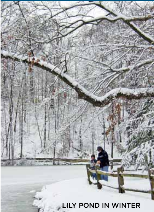
LILY POND IN WINTER