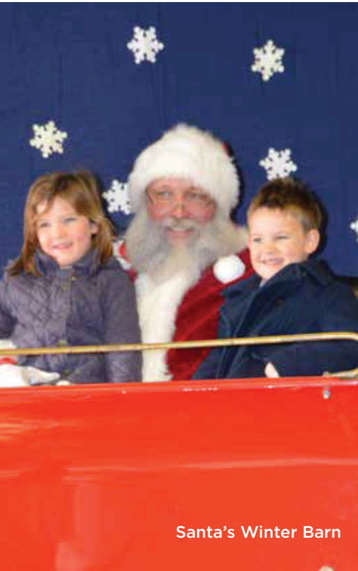
Santa's Winter Barn

BLACK FRIDAY GOLF SHOP SALE Mill Creek Golf Shop 11/25 | 10 am - 4 pm Blow-Out Sale with an abundance of special savings.