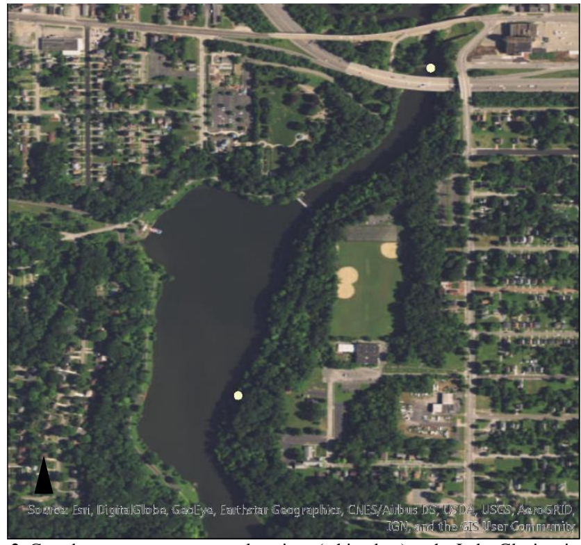
Figure 2. Canada goose nest treatment locations (white dots) at the Lake Glacier site, 2017.