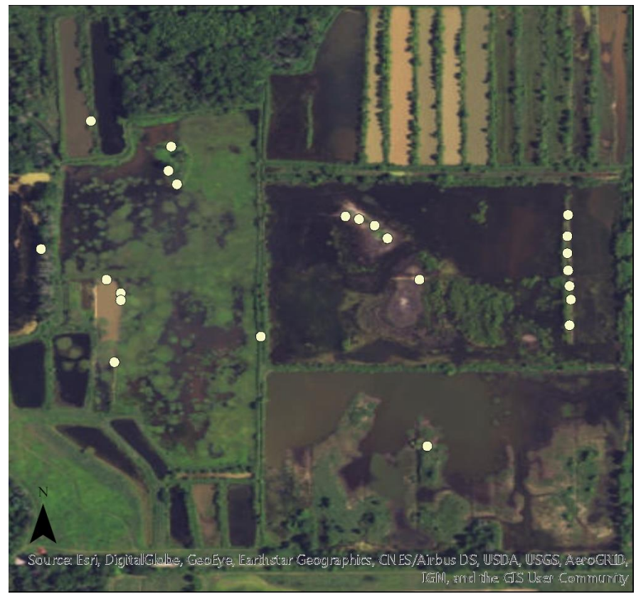
Figure 4. Canada goose nest treatment locations (white dots) at the Wildlife Sanctuary site, 2017.