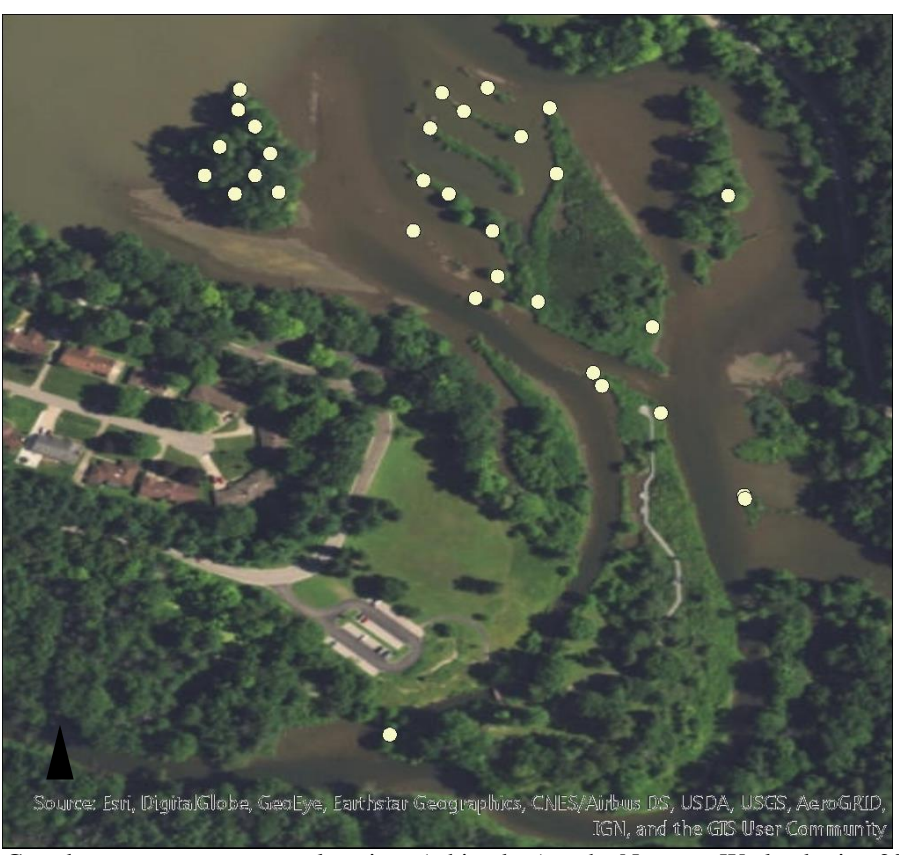
Figure 1. Canada goose nest treatment locations (white dots) at the Newport Wetlands site, 2017.