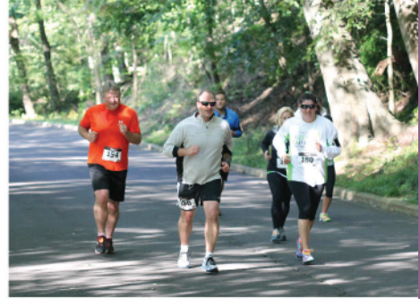
Sponsored by: WFMJ