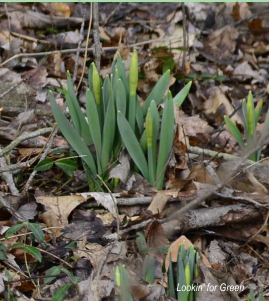
Lookin' for Green

Mill Creek Men’s Senior Golf League Sign-Up’s Mill Creek Golf Course Fieldhouse & Hole #55 Bar & Grille 4/1 | 9 – 11 am Senior golf league sign-up and meet & greet. Available for seniors 50+.