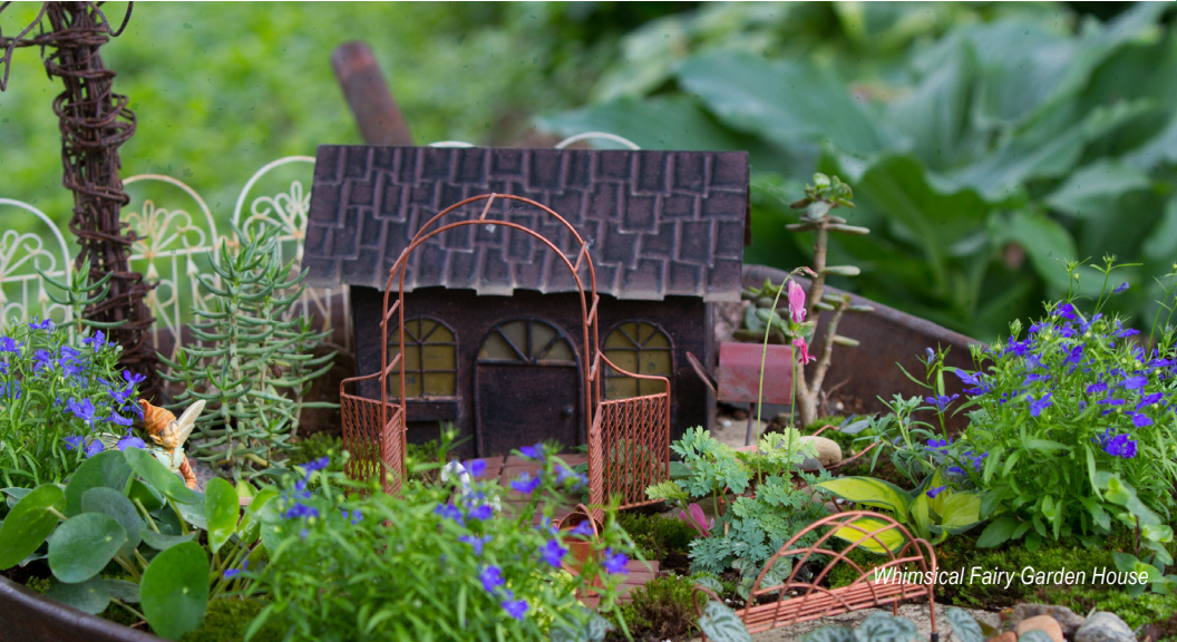
Whimsical Fairy Garden House

Dek Hockey League $ ♦ Wick Recreation Dek Rink Register by 3/27 Adults 18+. Now accepting league sign-ups for Dek Hockey. Teams must be registered by 3/27 with the season starting on 4/6. Adults 18+. Call WRA for details and to register/pay. $500/team.