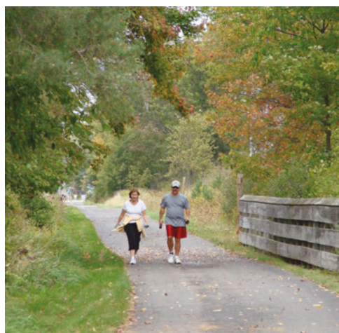
Whether on foot or on a bicycle, you'll enjoy the scenery along the way.