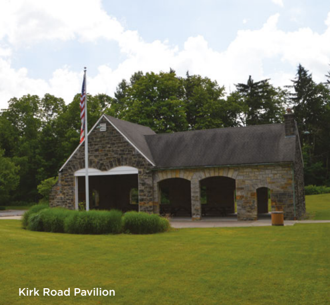
Kirk Road Pavilion